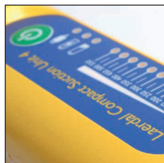
Control panel features include: On/Off button, external power indicator, low battery indicator and LED regulator display