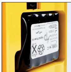
Field-replacable rechargeable NiMH battery pack