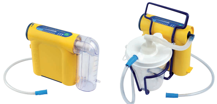
880061xx LCSU 4 (300 ML) 880062xx LCSU 4 RTCA (300 ML)