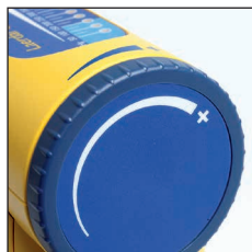
Variable vacuum regulator (50 - 550 mgHg)