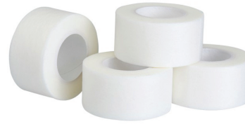
MICROPOROUS SURGICAL TAPE