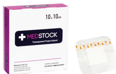
TRANSPARENT FOAM ISLAND DRESSINGS