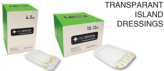
TRANSPARENT ISLAND DRESSINGS

The new cost-effective alternative for wound care Created by medical professionals