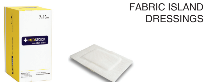
FABRIC ISLAND DRESSINGS