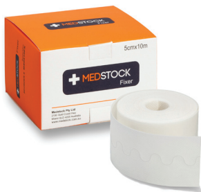
FABRIC FIXER ADHESIVE ROLL WHITE