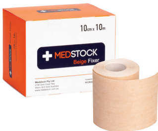
FABRIC FIXER ADHESIVE ROLL BEIGE