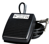
A803 Footswitch †