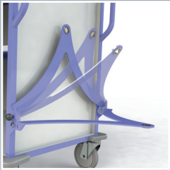
Tow Hitch 4H228TH