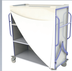
Front Cover 4H228FC